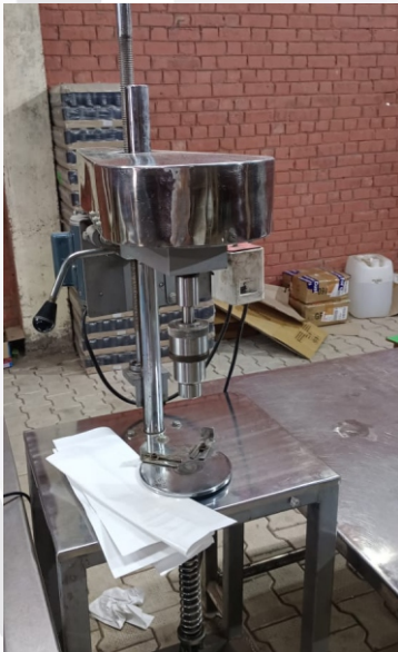
BOTTLE CAPPING MACHINE

At RV Organica, we have integrated all the sophisticated tools and machinery for production, testing, and other phases of manufacturing. Our clients need not worry about anything as we use the latest technologies and standard procedures to develop high-quality essential oils.