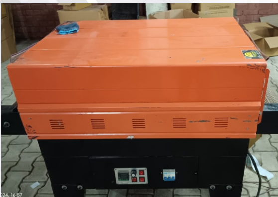
BOTTLE SHRINK MACHINE