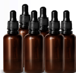
AMBER GLASS BOTTLE