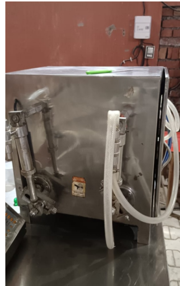
BOTTLE FILLING MACHINE