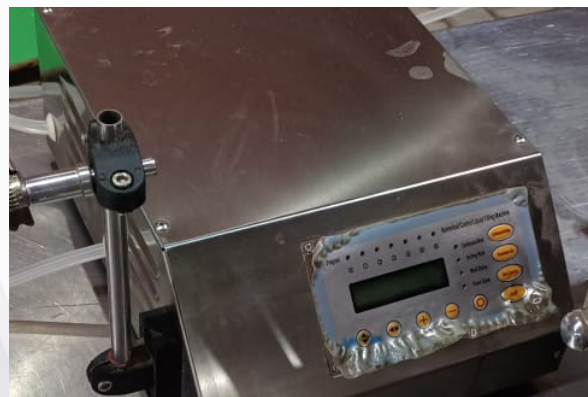
BOTTLE FILLING MACHINE