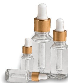
CLEAR GLASS BOTTLE