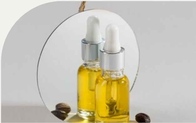
NATURAL ESSENTIAL OIL

DEALS IN ESSENTIAL OILS & CONTRACT MANUFACTURING