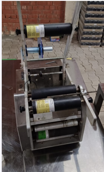
BOTTLE LABELLING MACHINE